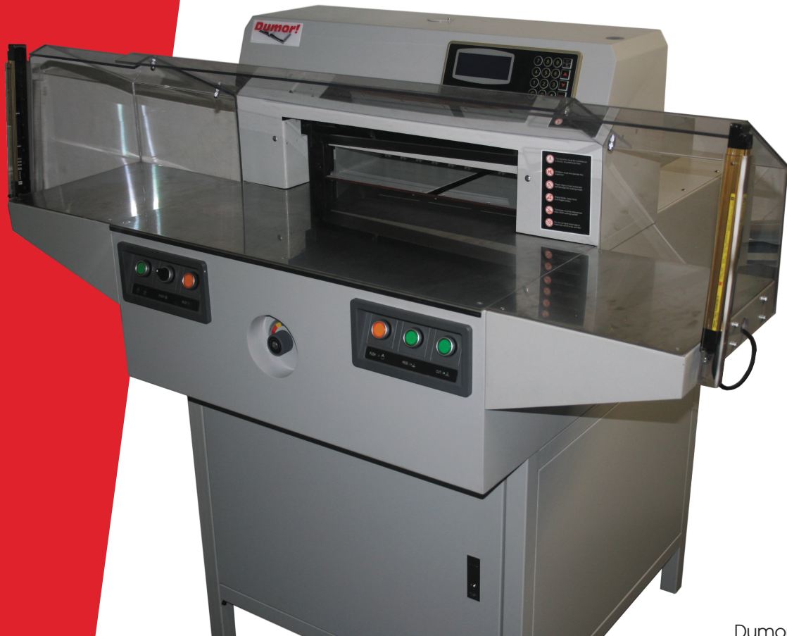
Dumor Digicut 52